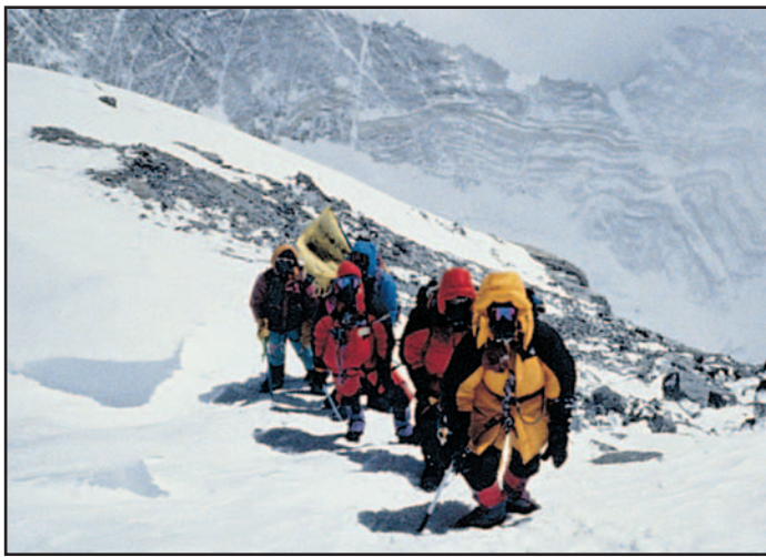
Modern-day ascenders of Mt. Everest have sophisticated clothing and equipment to help them make it in and out of the Death Zone.

the body. Fluid in the lungs, known as pulmonary edema , keeps desperately needed oxygen from getting to the muscles and brain, causing weakness and confusion. Fluid leaking into the brain, cerebral edema , causes dangerous swelling, hallucinations, and irrational behavior. Both pulmonary and cerebral edema can kill. The only cure is retreating to a lower altitude.